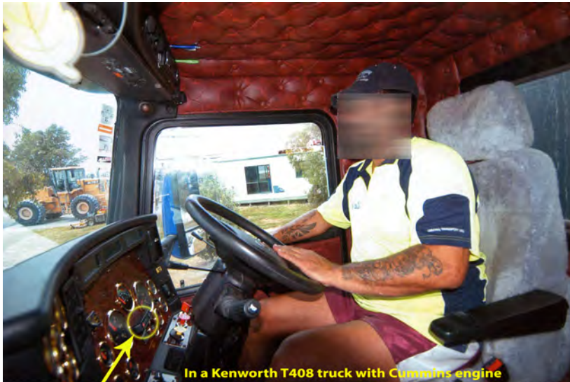
In a Kenworth T408 truck with Cummins engine

Keeping you up to date with new model releases and general information about our products